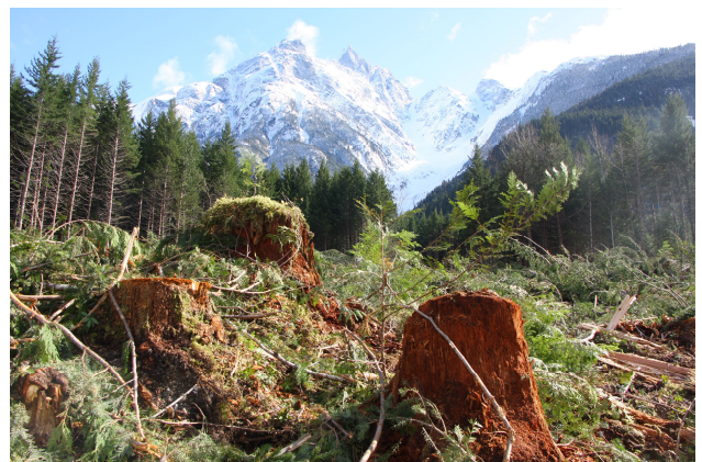
Second growth block logged and planted 2018