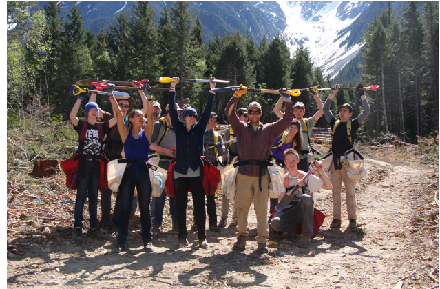
SAMS Outdoor class tree planting crew

help us engage better with the broader community and we appreciate the representation from many local organizations. Please check our website for more info: bccfl.com .