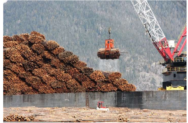
Barge loading Chilcotin pulp logs

Please check our website: bccfl.com and on facebook.