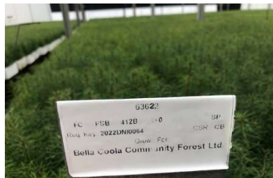
Doug-fir seedlings at the nursery

Log values started to decline in 2022 but they were still favourable and it is unfortunate that we were not able to log more and take advantage of the relatively high prices. Markets have continued to decline and 2023 will be challenging economically. To address the old growth deferrals issue we need to push ahead with valley forest planning.